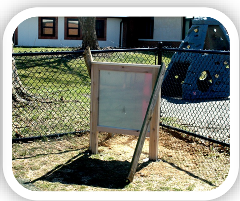
Thunder Wall constructed of Cedar & Stainless Steel.