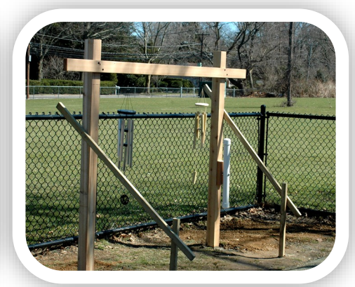
The "Arch" where there are wind chimes & a rain stick for auditory stimulus