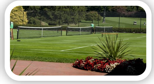
Test out your Wimbledon skills on the grass tennis courts

We need your help in soliciting items for our Basket Raffle & Silent Auctions which are a BIG part of our Golf Outing! Gift Cards/Gift Certificates to your favorite Restaurant, Beauty/Nail Salon, Day Spa, Gym